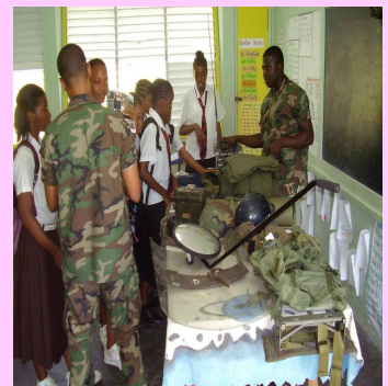
Demonstration by SVG Police Force