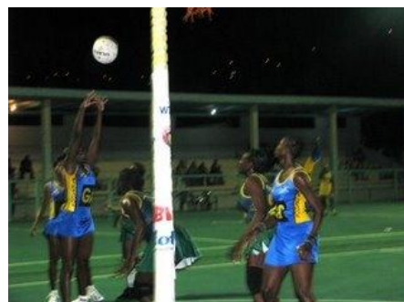
Team SVG in Netball action

The Ministry of Education invested a total cost of US$54,000 in the training programme.