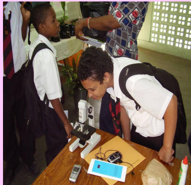
A potential Plant Pathologist ?

The main purpose of the Career Fair was to give interested students, as well as potential employees and members of the general public, the opportunity