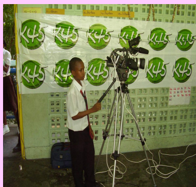
A budding Cameraman

Participating Agencies included tertiary educational institutions, the Private Sector (Commercial Banks and other private companies) and the Public Sector