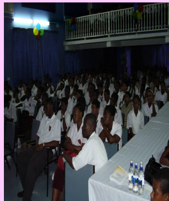
Students listen attentively to lecture

The main purpose of the Career Fair was to give interested students, as well as potential employees and members of the general public, the opportunity