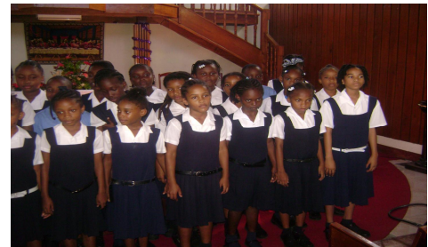
Students of the Calliaqua Anglican School performing set piece

The Ministry of Education will continue to organize the annual Christmas Music Festival.