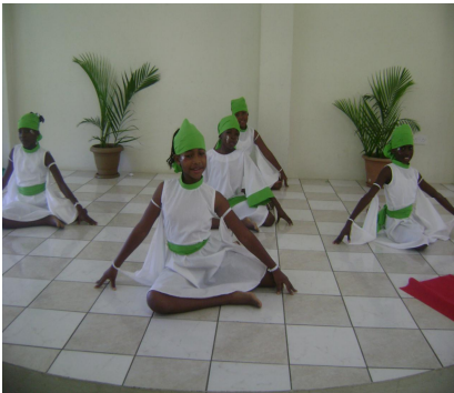
Dance piece by Questelles Government School

The curtains came down, with a big applause, for another of the Ministry of Education's annual Christmas Music Festival. Wednesday, 10th December 2008; marked the successful end of the nation-wide talent exhibition.